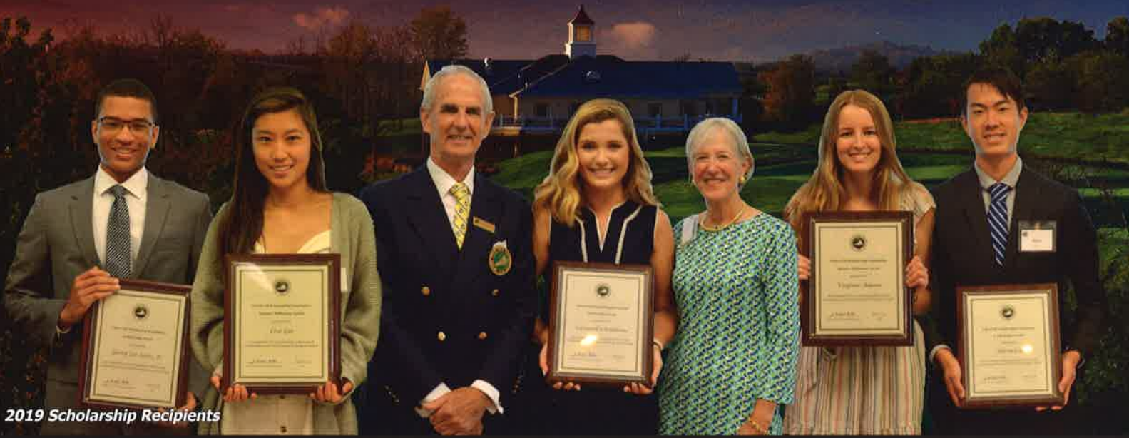
2019 Scholarship Recipients